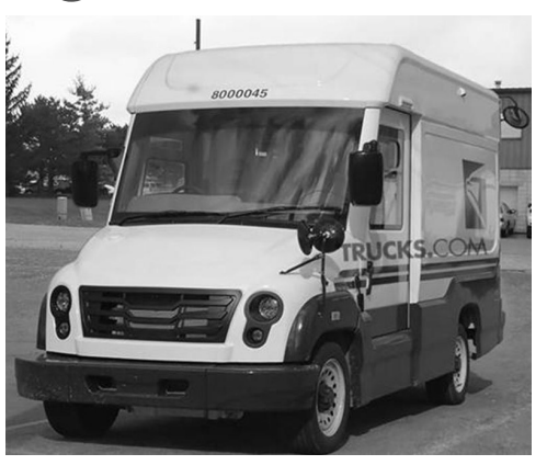
The U.S. Postal Service has launched full-scale testing of a series of prototype delivery vans from which it plans to select its next mail truck.

The order will be huge for the companies involved.